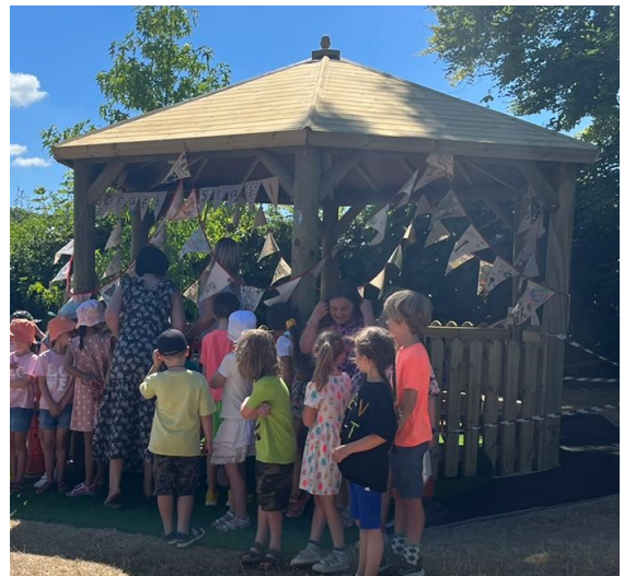
The grand opening of the outdoor classroom at the summer fair in July