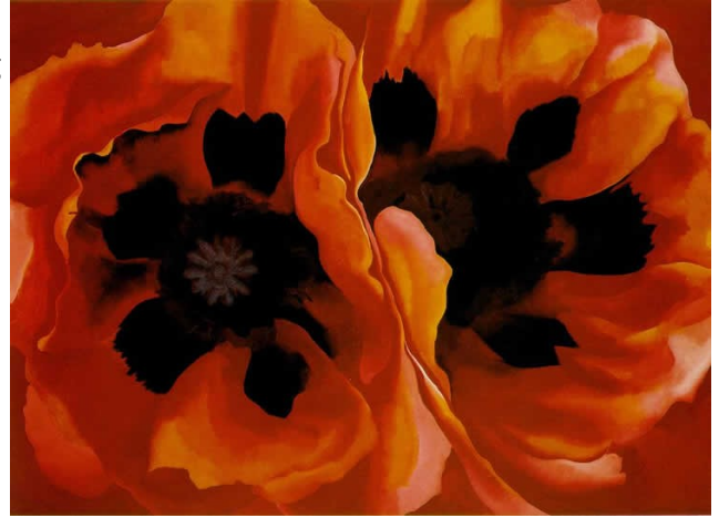
Oriental Poppies by Georgia O'Keeffe

This morning we held a two minute silence as part of our Remembrance Day learning. The children have been buying poppies, drawing and painting poppies and learning a little bit about why and how Remembrance day is celebrated. Badger Class in particular have been looking at the history of remembrance day and how the poppy fits into this. As part of their art curriculum they looked at a painting by Georgia O'Keeffe entitled 'Oriental Poppies'. The children then did their own paintings which have been taken to Huggins Edwards and Sharp Estate Agent in Bookham, where they will be displayed. Last year we received a delightful letter from a local resident, saying how much she had enjoyed the paintings, how beautifully and carefully they had been painted and how the pictures had brought 'joy' to those that had seen them and 'helped them to reflect on the joy of peace and the proud remembrance of sacrifice.' We hope that the paintings displayed this year will have a similar affect on those who see them.