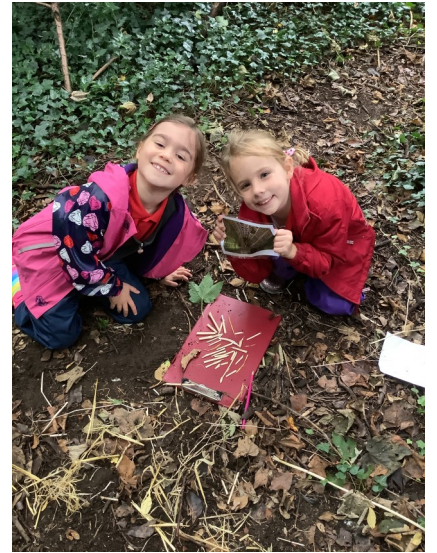
Badger Class' interpretations of animals in the woodland using natural materials found on the woodland floor. Their attention to the colours was exceptional as was their teamwork